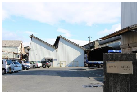
Refinverse Ichinomiya Plant

REAMIDE® is currently used in a wide range of applications, including building materials, home appliances, apparel, and office furniture.