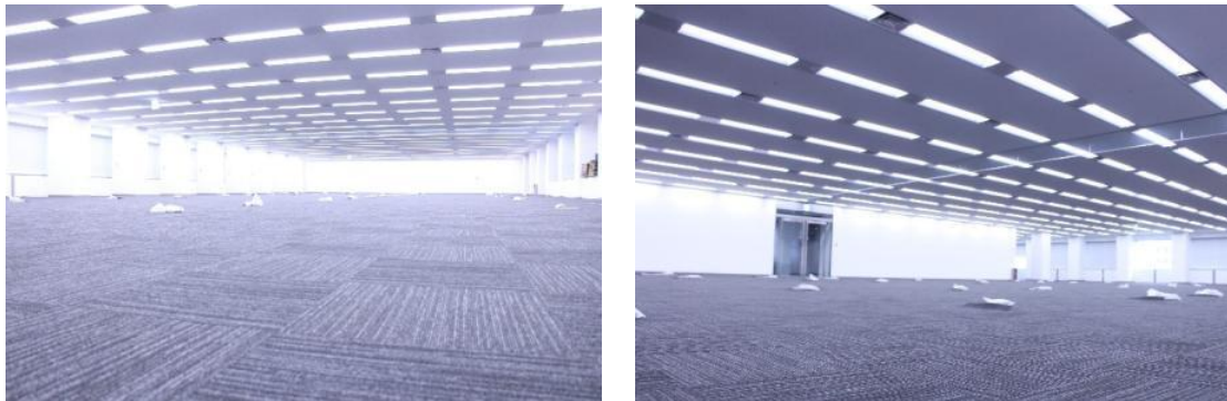
en Japan office expansion (after carpet tile installation)

Utilizing Refine Powder, the SUMINOE Group manufactures and distributes horizontally recycled carpet tiles under the brand "ECOS®", thus creating a circular system where products made from recycled materials are returned to the market.