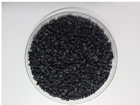
REAMIDE® Recycled Nylon Resin Made from Intake Manifolds

We will also showcase this new grade of REAMIDE® in the Refinverse booth at the Sustainable Material Expo to be held at Makuhari Messe from December 7 (Wed) to 9 (Fri).