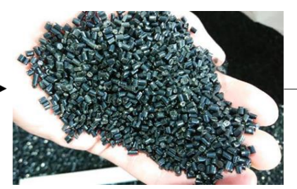
Recycled Nylon Resin