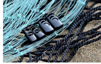
Clothing and Accessory Parts

We will continue to cooperate with companies that have a high awareness of environmental problems in the future with the aim of realizing a sustainable society. We will do this by developing materials and applications to further enhance the added value of recycled materials in addition to simply recycling discarded fishing nets.